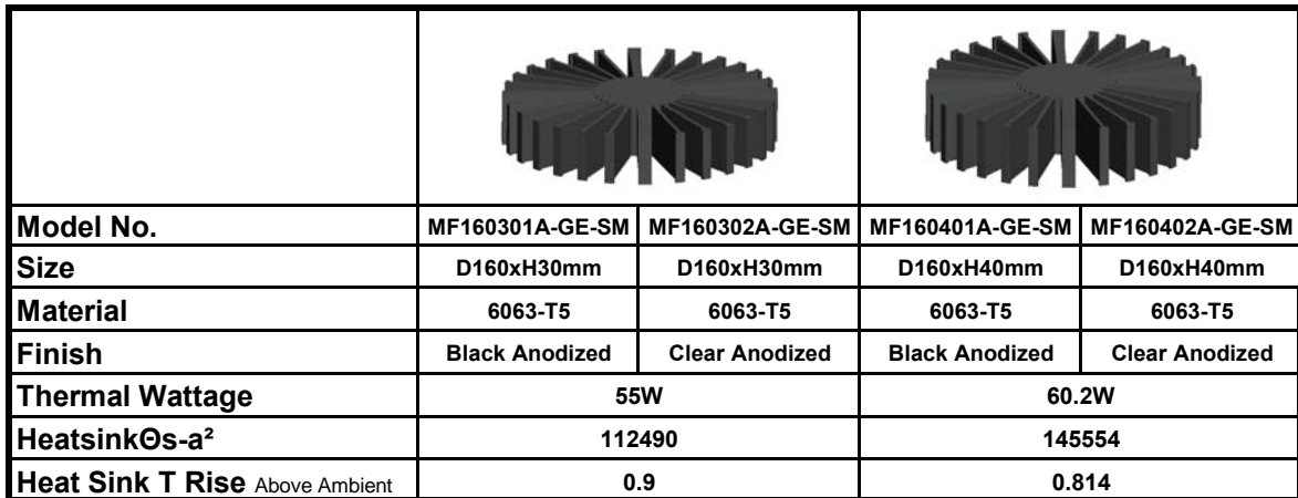
Heat sink to ambient temperature rise T_{hs-amb}(^{\circ}C)